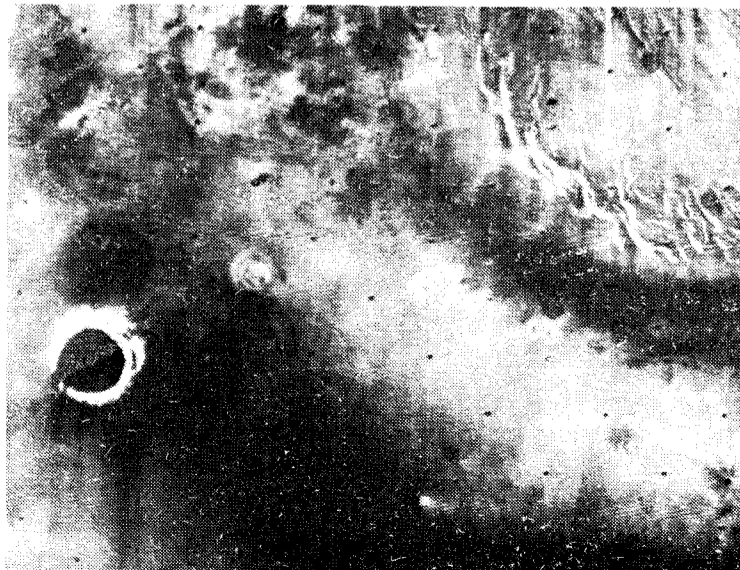
SINCE THIS IS THE LAST DAY OF SUMMER, Mariner 9 brings us a look at spring in the northern hemisphere of Mars. The bright swath curving through the center is the edge of the polar cap. The crater on the left is believed to be water ice, instead of the usual carbon dioxide ice, by project scientists.