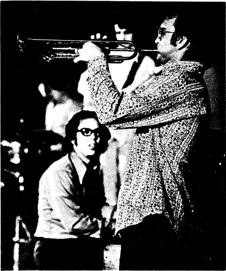
This was the scene at the Y-sponsored benefit concert for the Foothill Free Clinic last Saturday in Baxter.