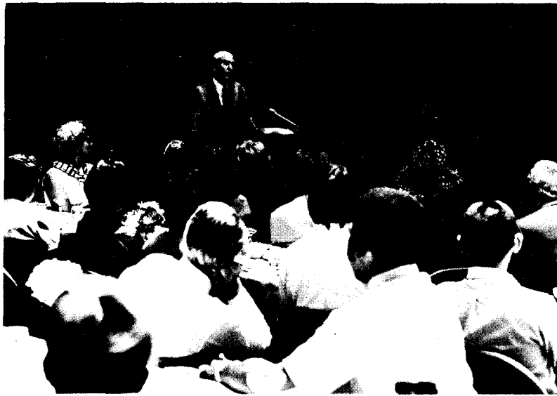
U.S. Senator Alan Cranston reveals that expiration of the draft law does not mean an end to the draft to an Athenaeum luncheon audience on Monday.

The only limitation imposed upon the rivet are the libel laws of