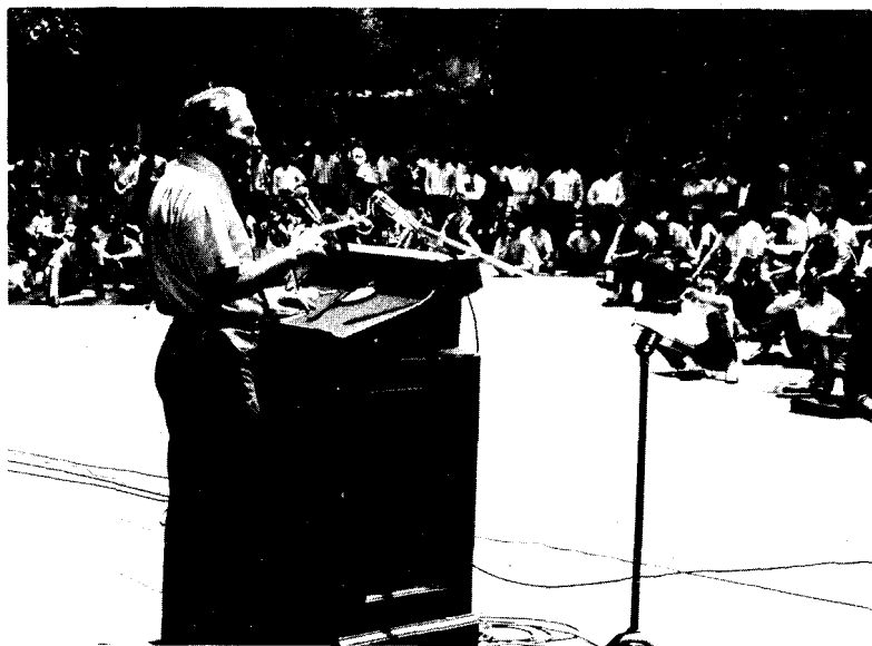
Los Angeles Mayor Sam Yorty spoke Monday on the Olive Walk as part of the Caltech Y's political entertainment series. He warned that the Russians might develop an SST before the U.S.