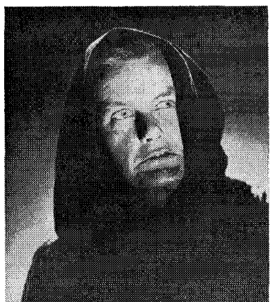
L. T. Stupor, TECH undercover agent who has infiltrated B&G.

Develop your innate phucque-up talents under B&G's expert tutelage!