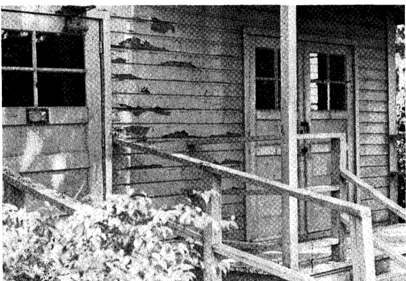
New $23 million housing complex to be built by B&G.