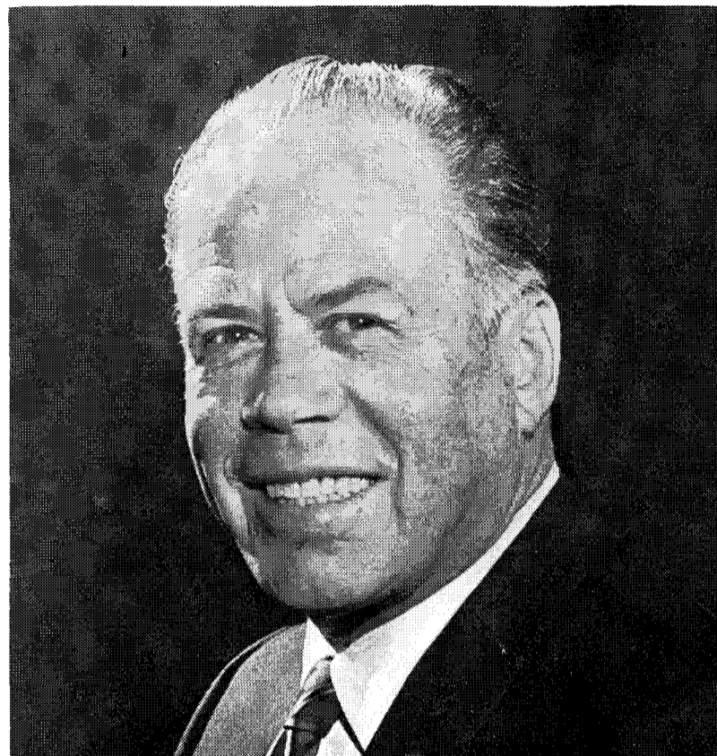
Senator Thomas Kuchel, tonight's speaker for the YMCA's Beckman address.