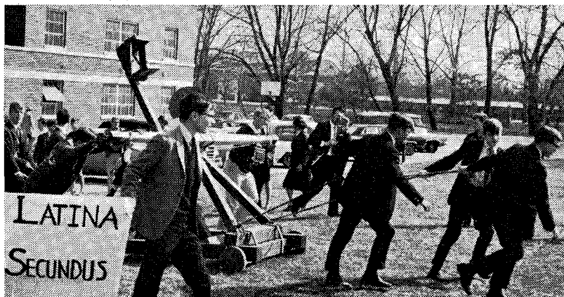
Stouthearted Latin students advance hauling formidable catapult with redoubtable range of five feet.