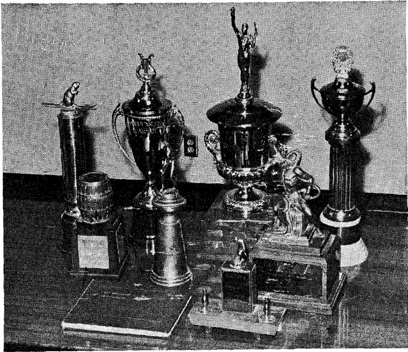
A few of the trophies distributed at the Spring Awards Assembly. Note the newly reorganized R. P. Lighthouse Memorial Wall Socket Award in the rear.