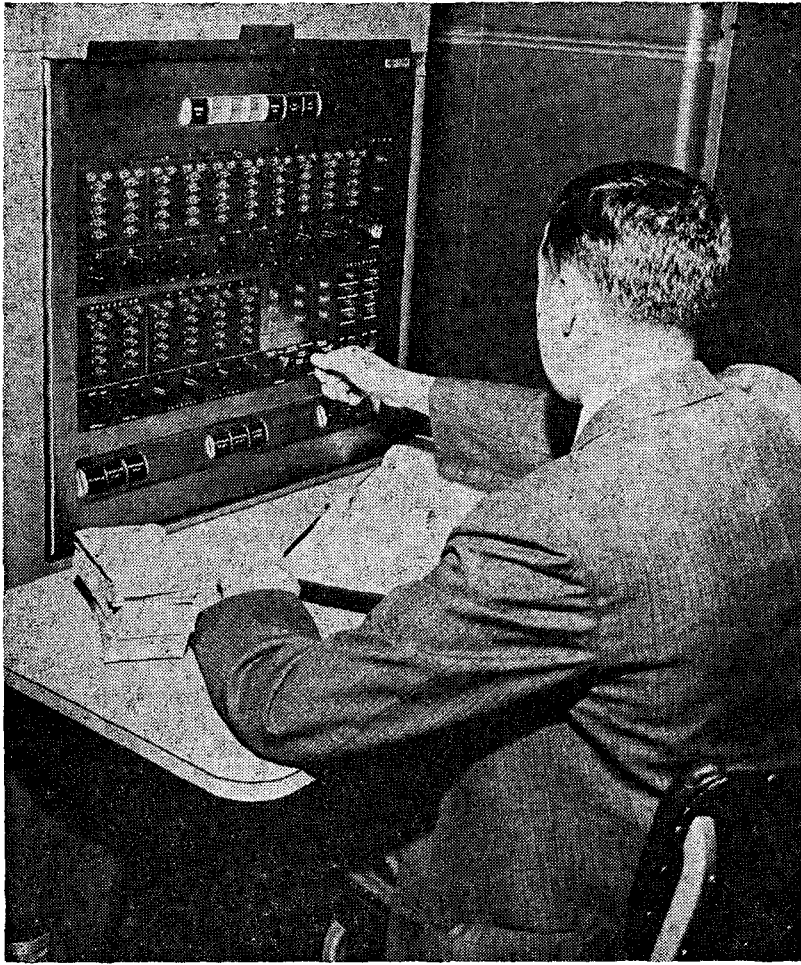
"What do you mean, give me the JPL long distance line?"

Caltech students interested in these projects are urged to contact the Caltech Y office immediately. Sirelson also pointed out that the Y maintains a large file of materials on overseas travel, including sailings of student ships during the summer, and summer projects sponsored by organizations other than the Y.