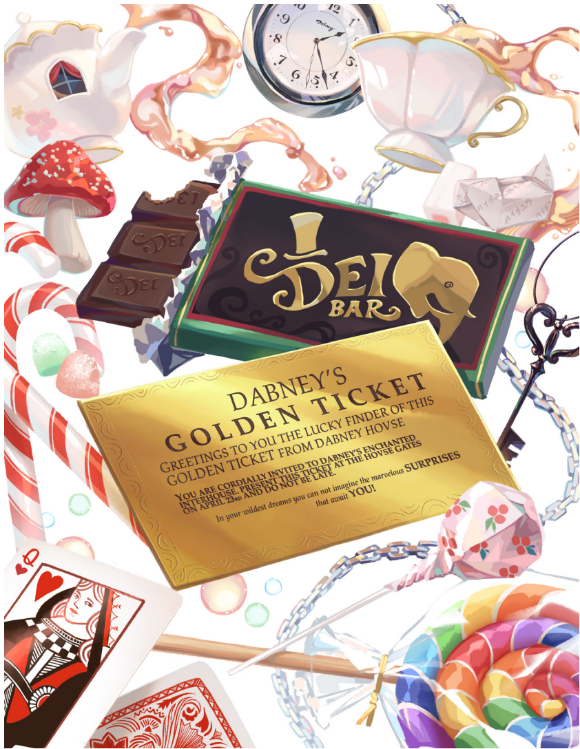
Dabney Interhouse ("DEI")