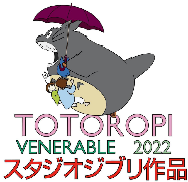
Venerable Interhouse ("OPI") Poster by: Aditi Seetharaman