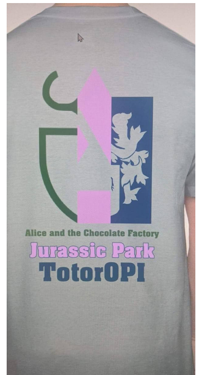
DAVe Media by Kyle Piper