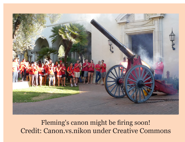
Fleming's canon might be firing soon!

On February 18th, the Caltech authorities informed all individuals of the Spring Term decision. Much like the last two terms, Spring will also be virtual and public health officials in the area did not approve the requests to have a limited number of in-person classes. However, the email still contained optimism for a