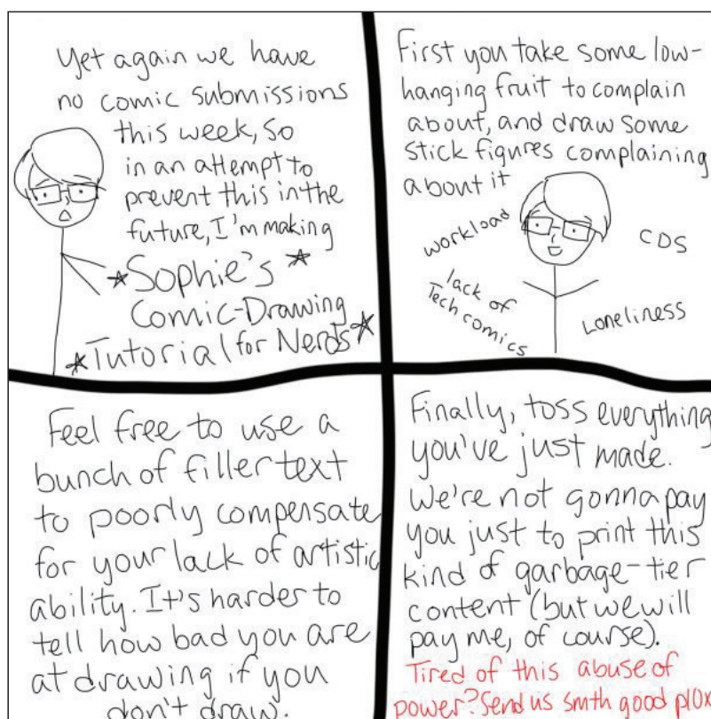
Sophie Piao (b. 1997) Comix Tutorial 2018 Digital.

We are always accepting submissions for comics, and will pay you.