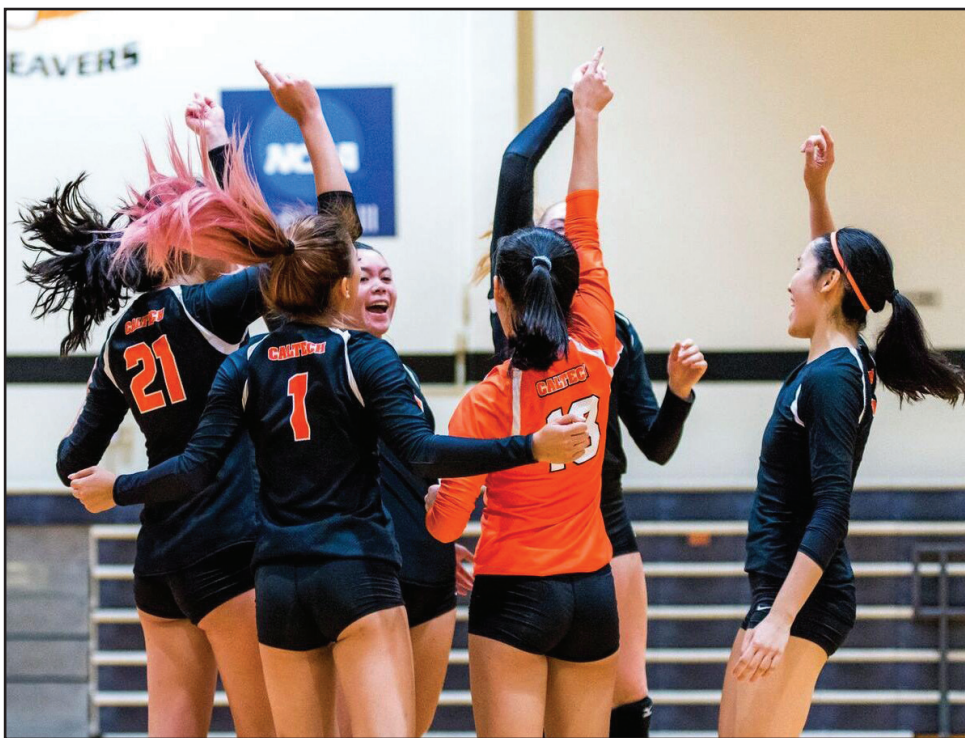
We did it!!!!