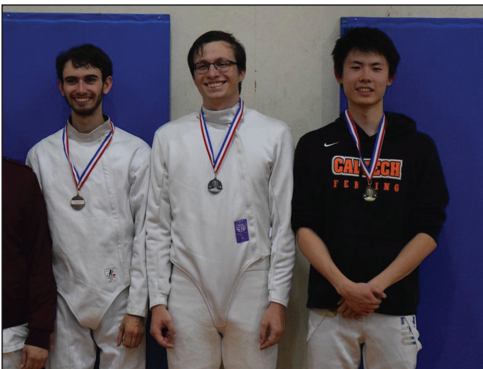
Smile for the camera, boys.