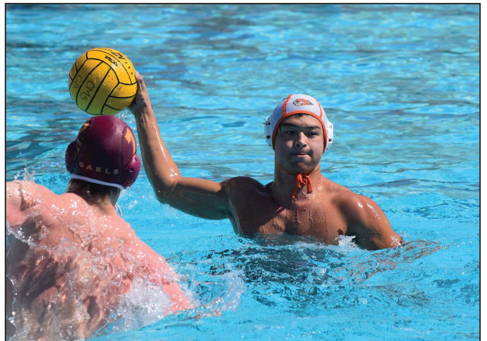
Is it legal to bonk people on the head with the ball in water polo?