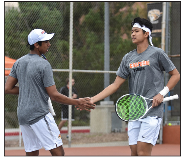
Patty cake, patty cake...