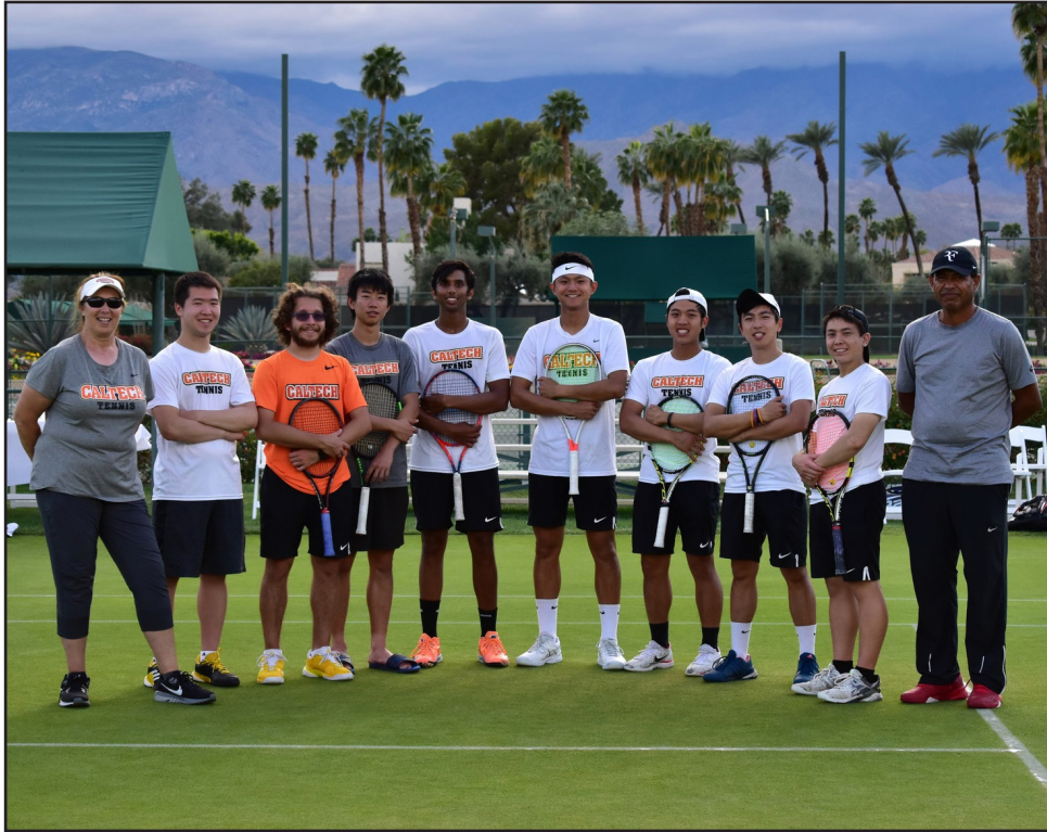
I don't think they know how to hold their rackets.... How did they get third seed???