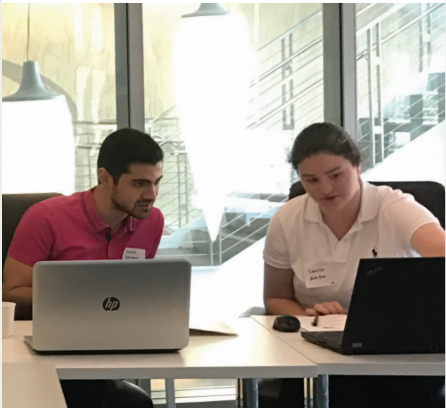
EAS graduate students attending a communication workshop