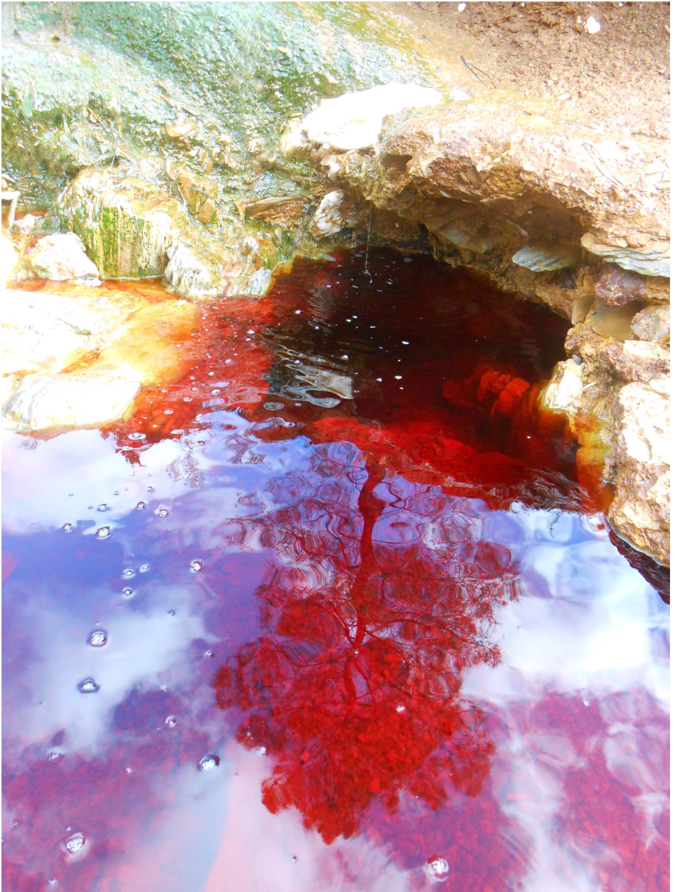
Rio Tinto | Peter Buhler | Digital Photography