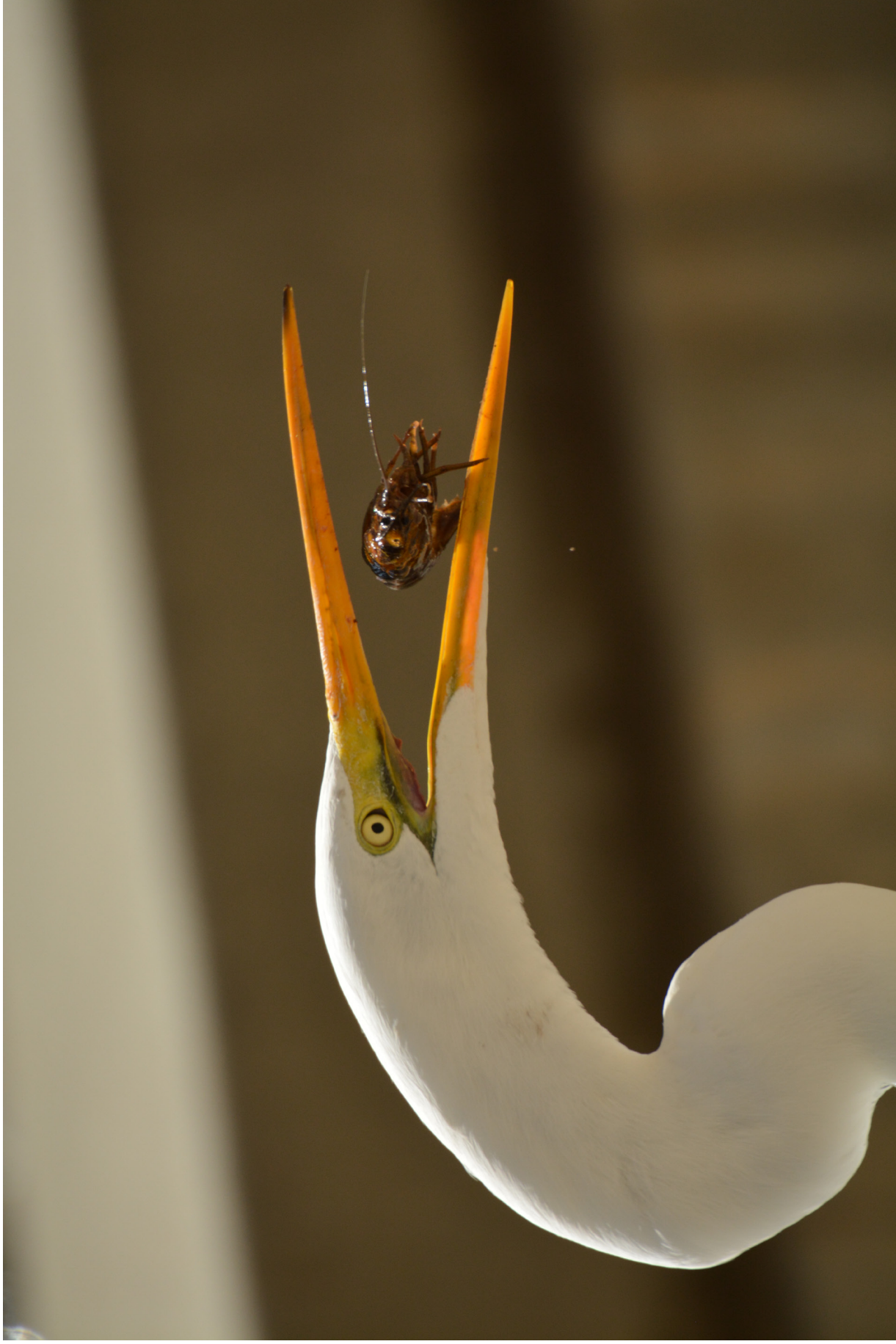
Lunch | Alec Brenner | Digital Photography