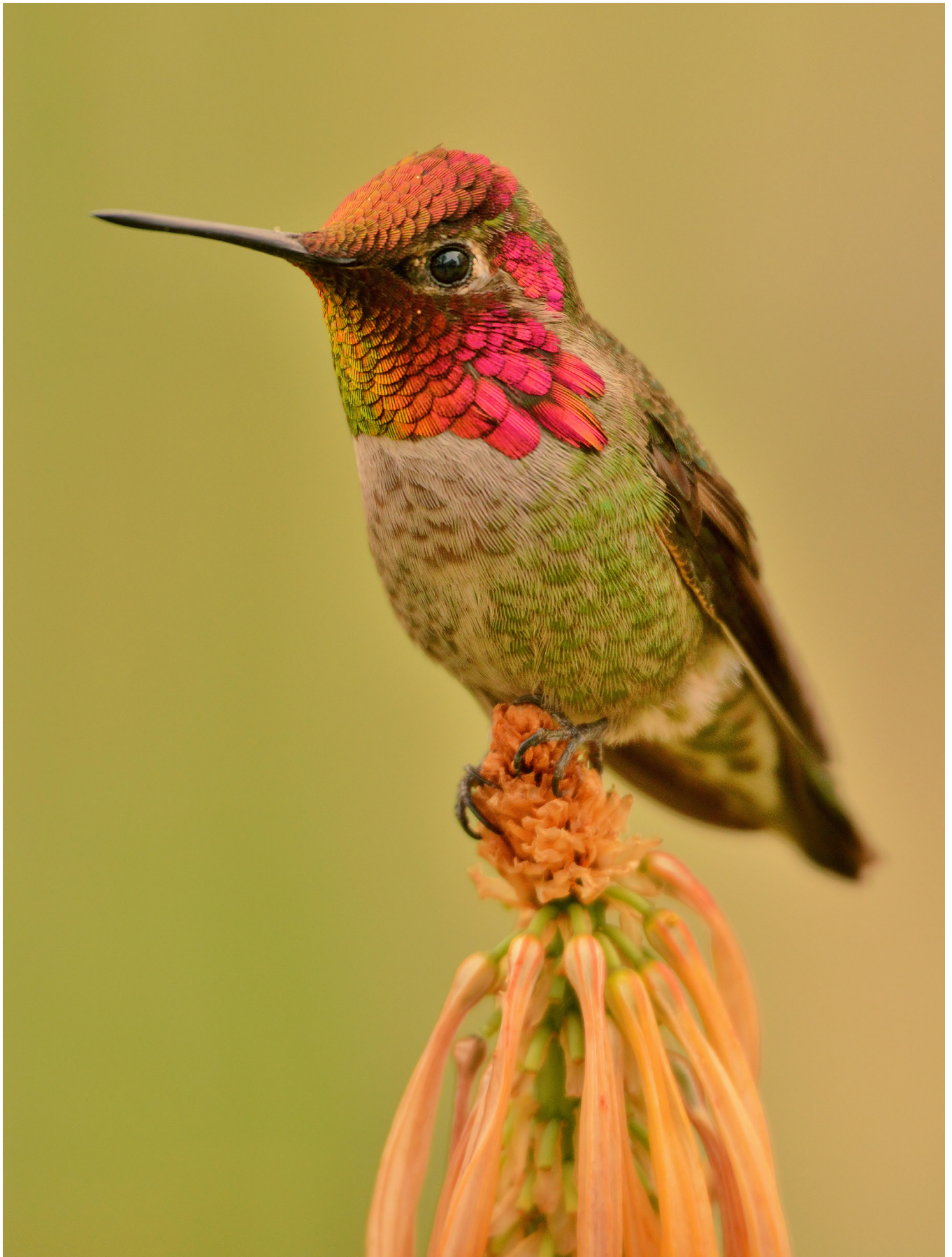
Anna's Hummingbird