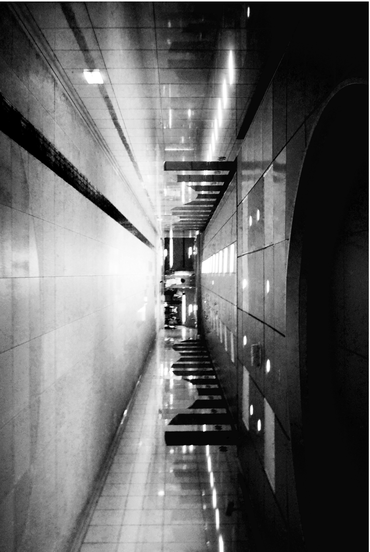
No End In Sight | Kiara Simpao | Digital Photography