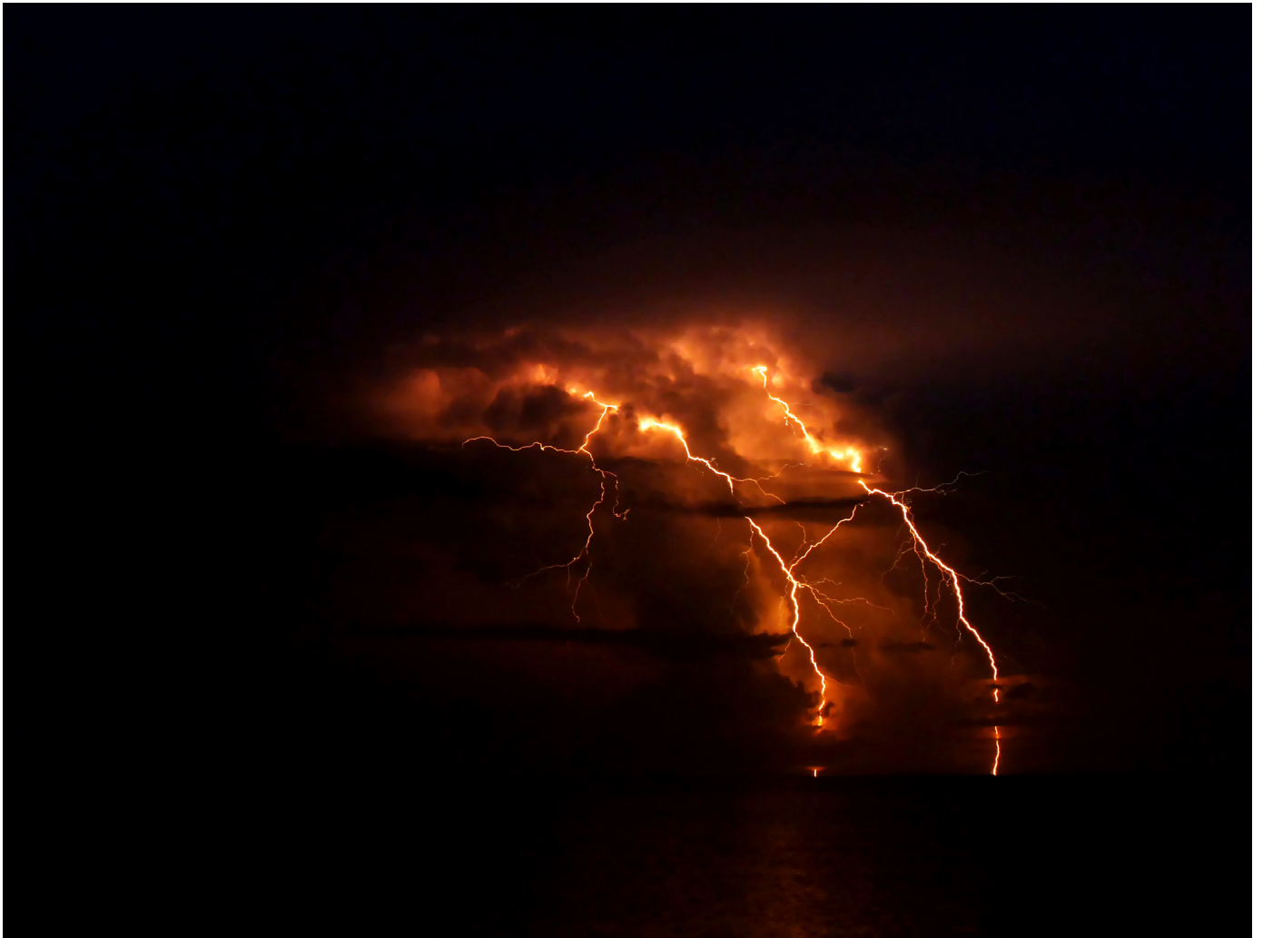
Storm over the Gulf | Alec Brenner | Digital Photography

And only the fury of mortals glimmers in its night.