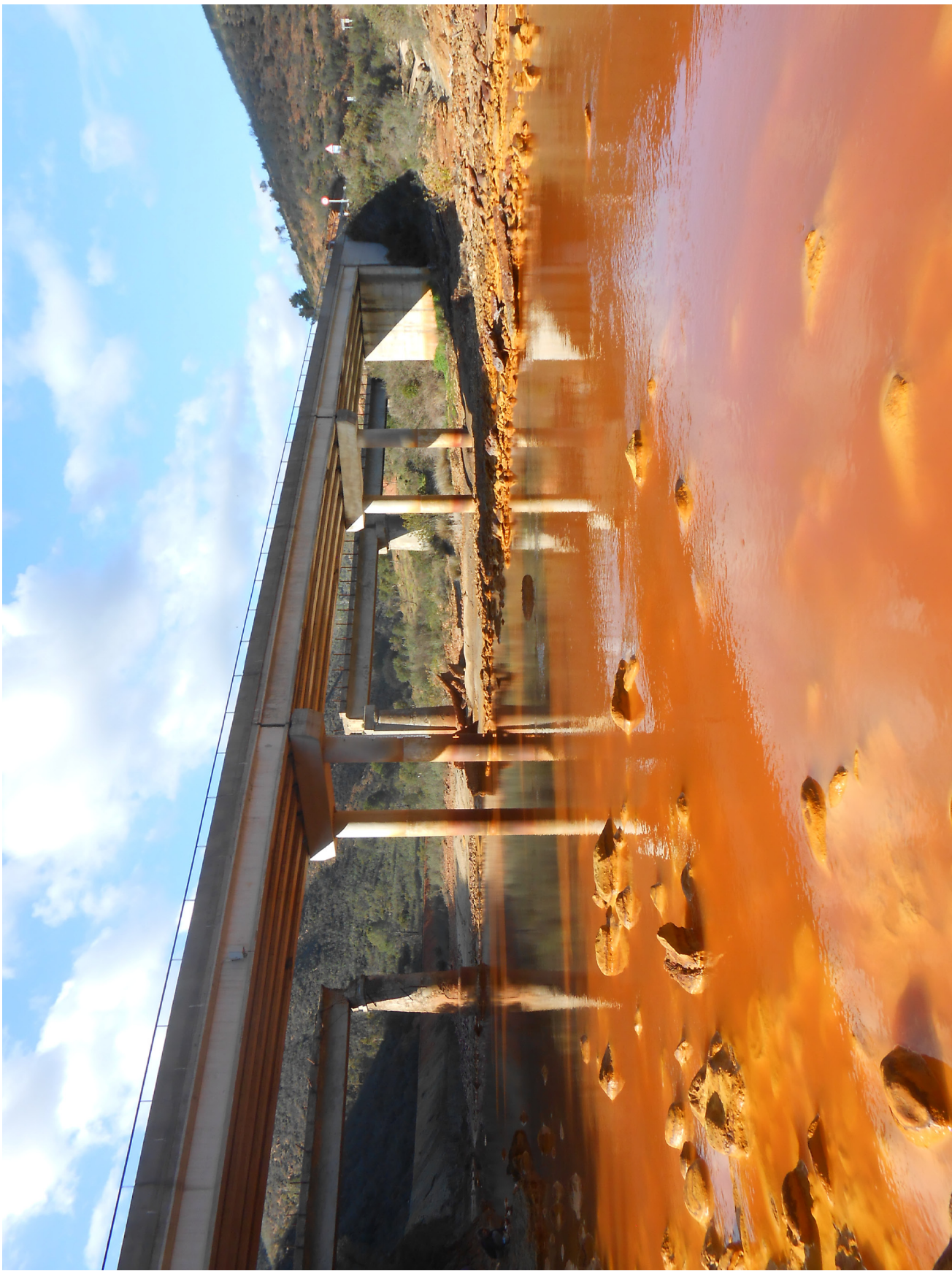
Orange Bridge | Peter Buhler | Digital Photography