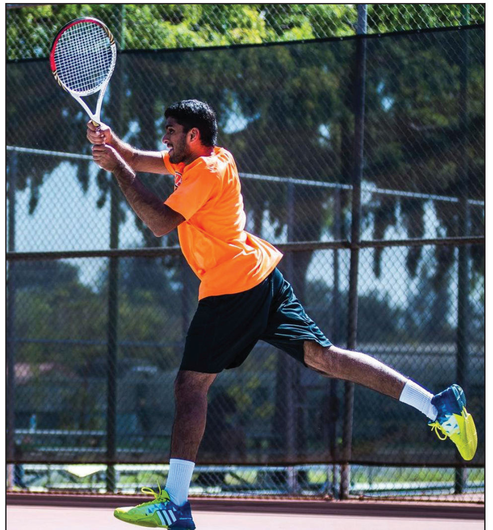
Is this tennis or tryouts for the ballet? I think you'd make a fine Sugar Plum Fairy.