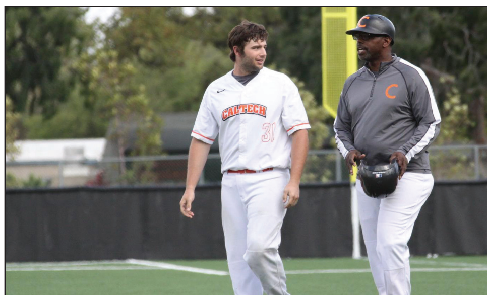
Such an athletic photo of an athletic athlete doing athletic things. C'mon Caltech, gimme something to work with here.