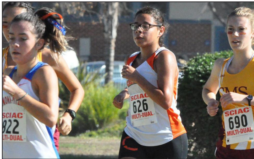
Girl, no one looks that good running. Are you sure you're trying - you didn't even break a sweat!?!