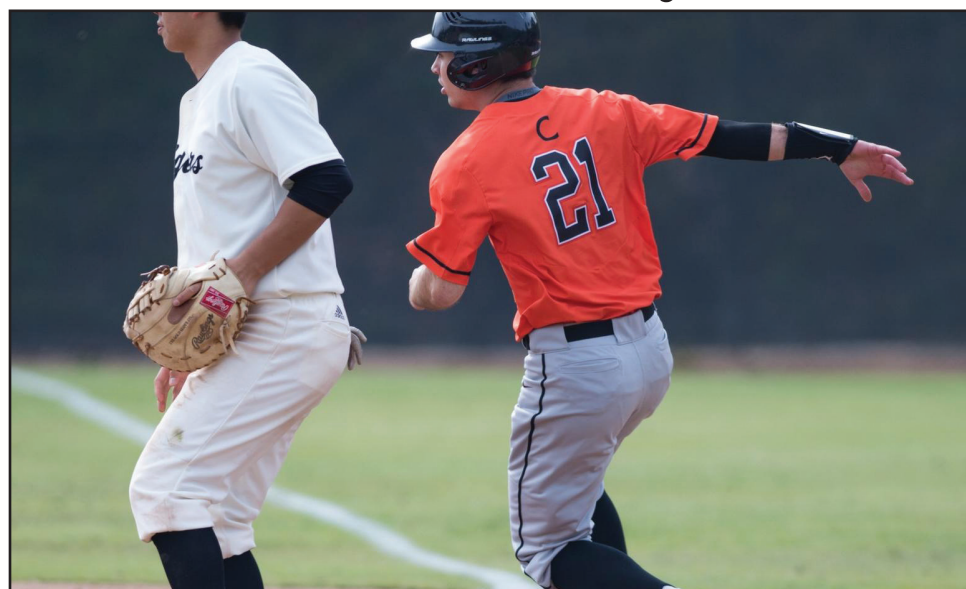
Sliiiiide to the left. Sliiiiidee to the right. FREEZE. Everybody clap your hands. *clapclapclap* -gocaltech.com

The weekend series began with ceremonial dual first pitches to officially commemorate