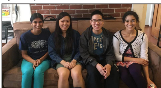
The Caltech Y Cabinet