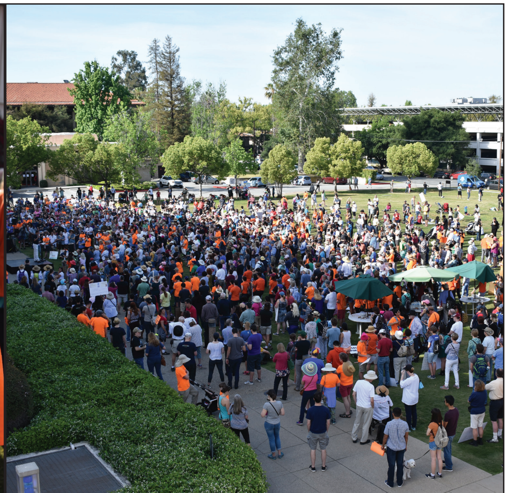
The crowd gathers to hear speakers before marching to Memorial Park.