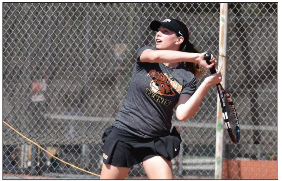
Heigh-ho, heigh-ho - over the fence it goes.

give Caltech a 2-1 lead after doubles, falling 9-7 at #3 after Redlands had picked up the first point of the match at the top spot. The Bulldogs quickly clinched the match with decisive victories at #1, #5 and #6 singles, but Zhou gave UR's Emily Murnin all she could handle in her second match since moving up to court #2. The rookie took the first set 6-1, but was broken in the second (6-3) to lead to a superbreaker. Zhou ultimately fell 10-8, leaving a bitter taste in the Beavers' mouths ahead of a potential third-place rematch in the final round of the SCIAM Championships in three weeks.