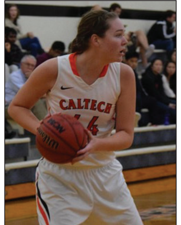
"Wait ...what were the rules of this game again?"

Panthers by just five points heading into the second frame. The Panthers, however, took control in the second and third quarter with the three-pointer being one of the game's key differences. Chapman made six more three-pointers than Caltech, but only outshot the Beavers by just over one percent. Caltech did win the rebounding battle and registered more points in the paint, which could be a point of emphasis the next time these two teams meet.