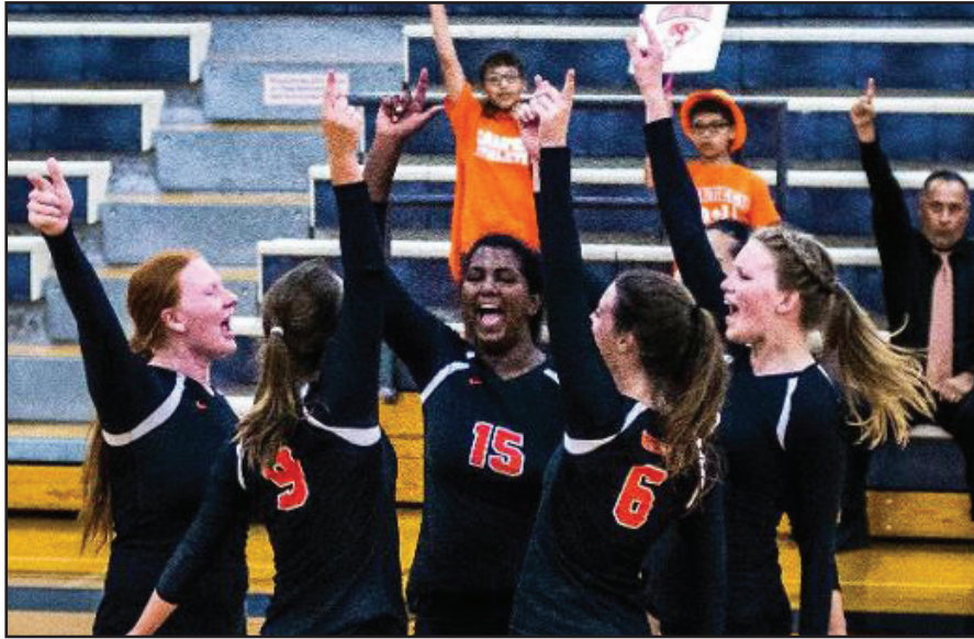
Volleyball and their many (read three) fans do a cheer together.

Lauinger notched a kill to take over the serve and kept it for three more points to halve the deficit.