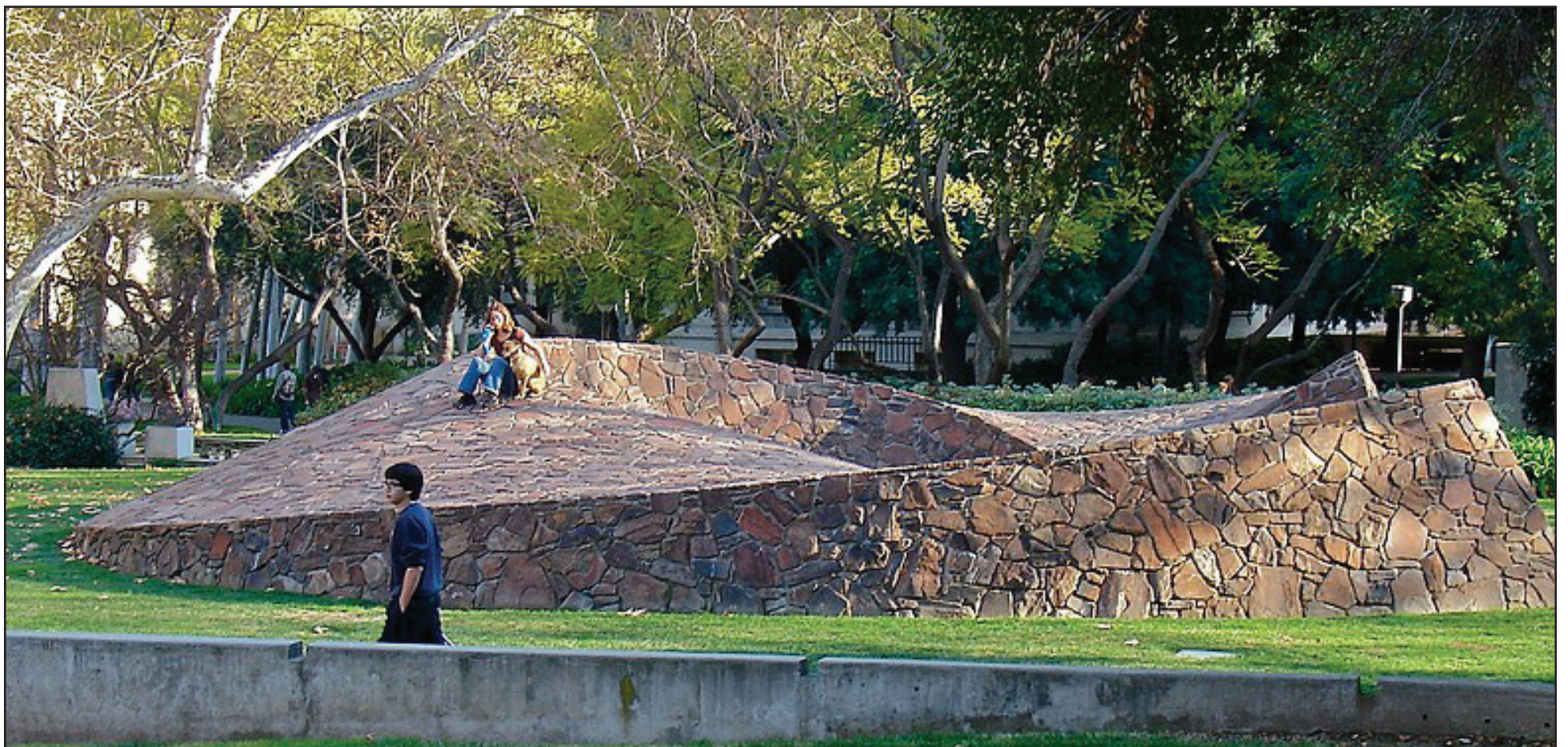
Moore's Stone Volute. Story on page 7

Music classes here at Caltech will teach you the details about the history and the significance of Ravel and Stravinsky in the past and the present; that's not my goal here. I hope that I have demonstrated that the experience of music is important and exciting. Attending a live concert, the details of the venue and the performers affect you and your experience of the music. Listening to a recording is an incredible way to share musical feeling across time and space, but music is fundamentally a social art.