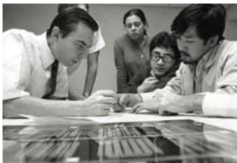
Carver Mead with group of students