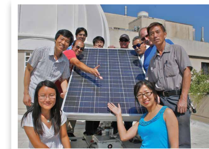
The Hoffmann group solar toilet research and development team on the roof of the Linde-Robinson Laboratory

To learn about their self-contained photovoltaic-powered domestic toilet, visit eas.caltech.edu/news/489 .