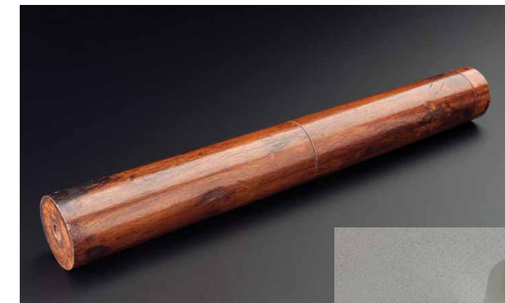
Laennec stethoscope, invented 1816

“Technology has only accelerated, and we have to be lifelong learners. As my favorite Bob Dylan line goes, 'He not busy being born is busy dying.'”