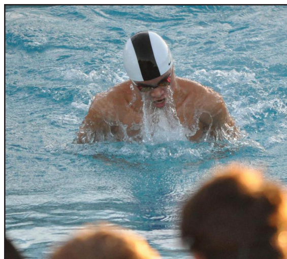
Have you ever thought about how cool swimming is? You kind of flail your body in specific ways and move really quickly through the water.