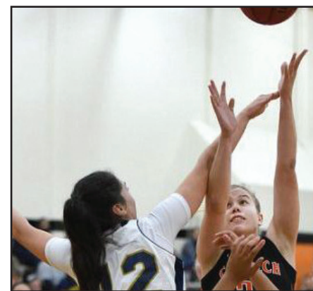
Should I be concerned that our women's basketball players keep exploding? That can't be healthy.