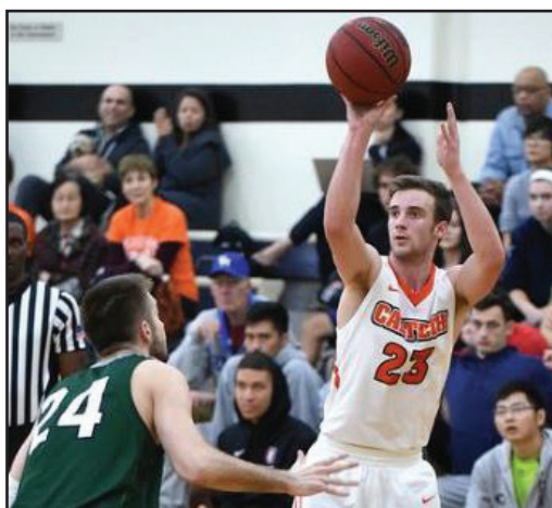
I thought the defender was supposed to try to block the shot, not duck.