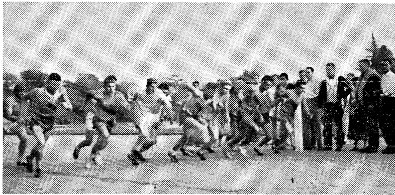
Harriers off to fast start

Thursday: Water Polo , frosh at Oxy. Friday: Soccer , Midland here. Cross Country , at Oxy. Saturday: Football , LaVerne at Bonita High, 2:30 pm at Pomona.