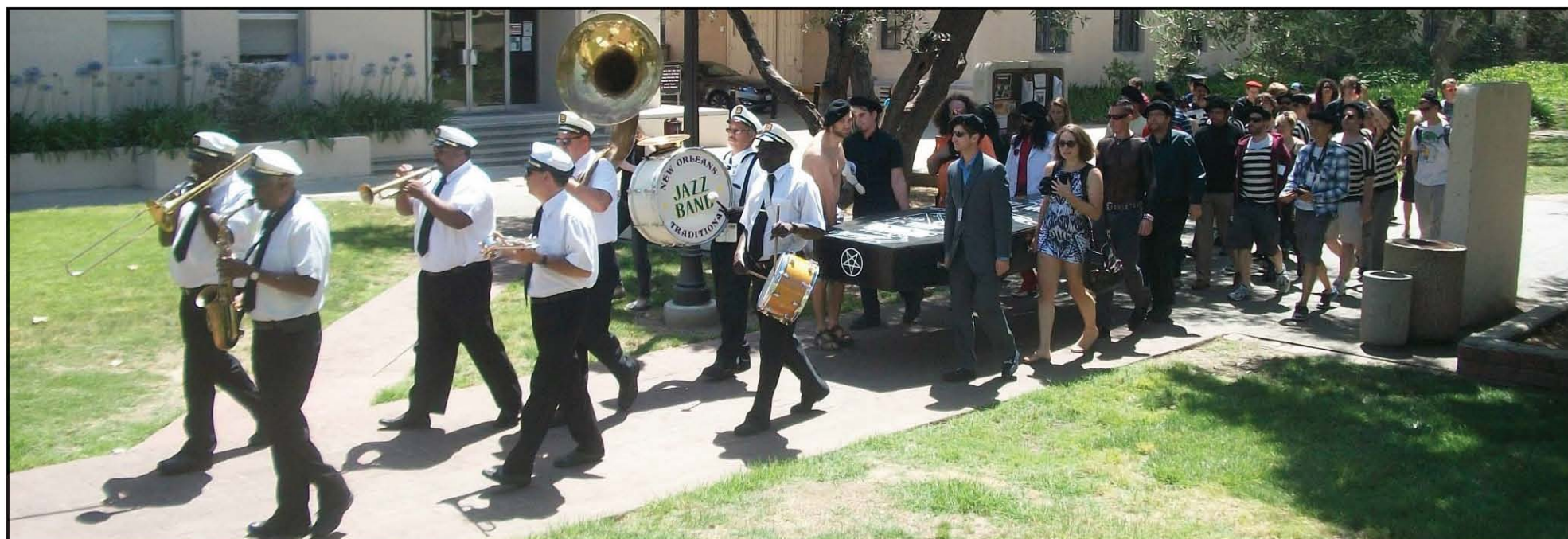
Ricketts Hovse alumni hold a funeral procession as they carry a coffin throughout campus, accompanied by a New Orleans-style brass band.