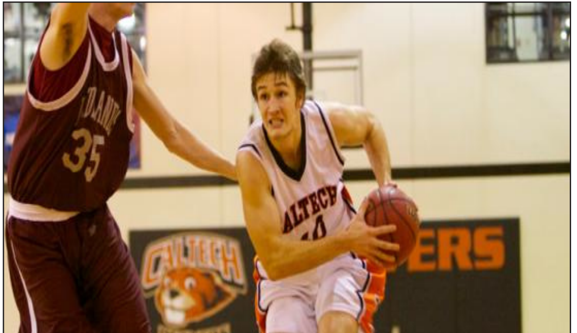
I think this is the athletics department's stock photo for the men's basketball team. I couldn't have chosen a better one, myself.