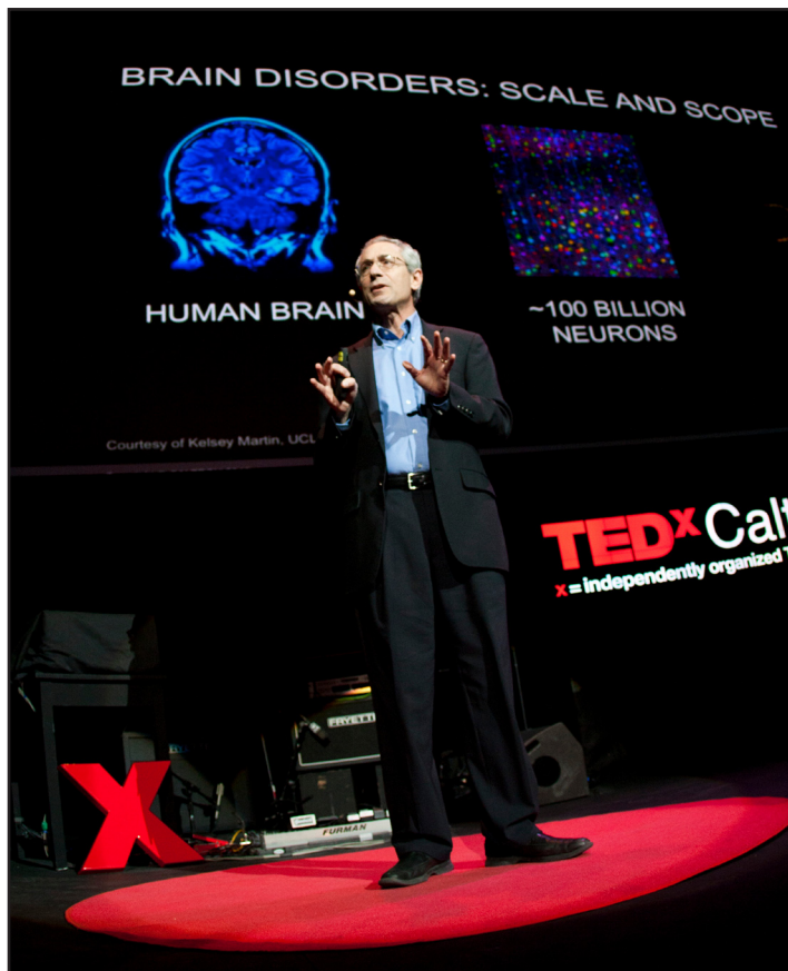
Dr. Tom Insel of the National Institutes of Health discussed the brain’s role in mental disorders.