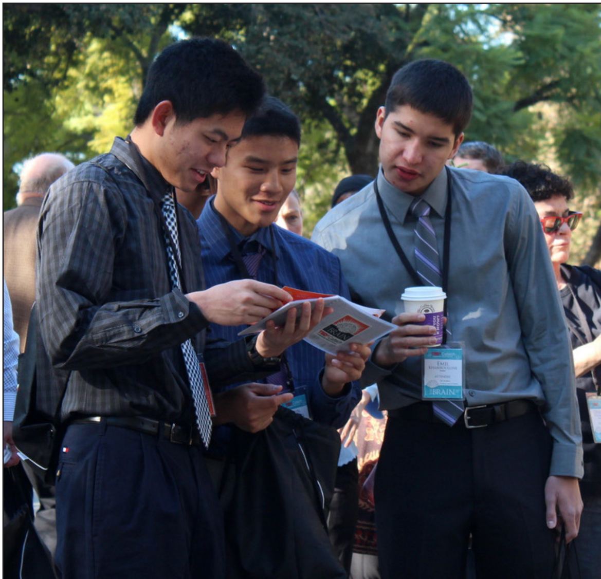
Caltech freshmen peer at the TEDxCaltech: The Brain program in anticipation of the event.