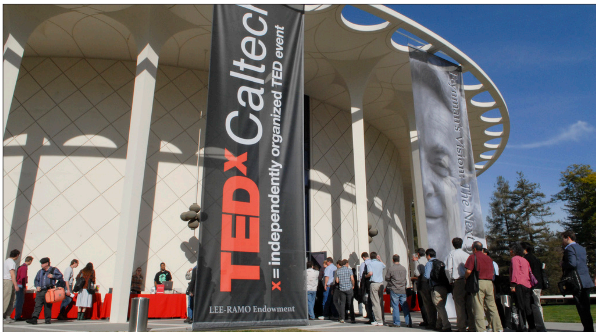
Attendees of TEDxCaltech 2011, "Feynman's Vision", line up to enter the Beckman Auditorium. Tickets for TEDxCaltech 2013, "The Brain", are currently on sale.