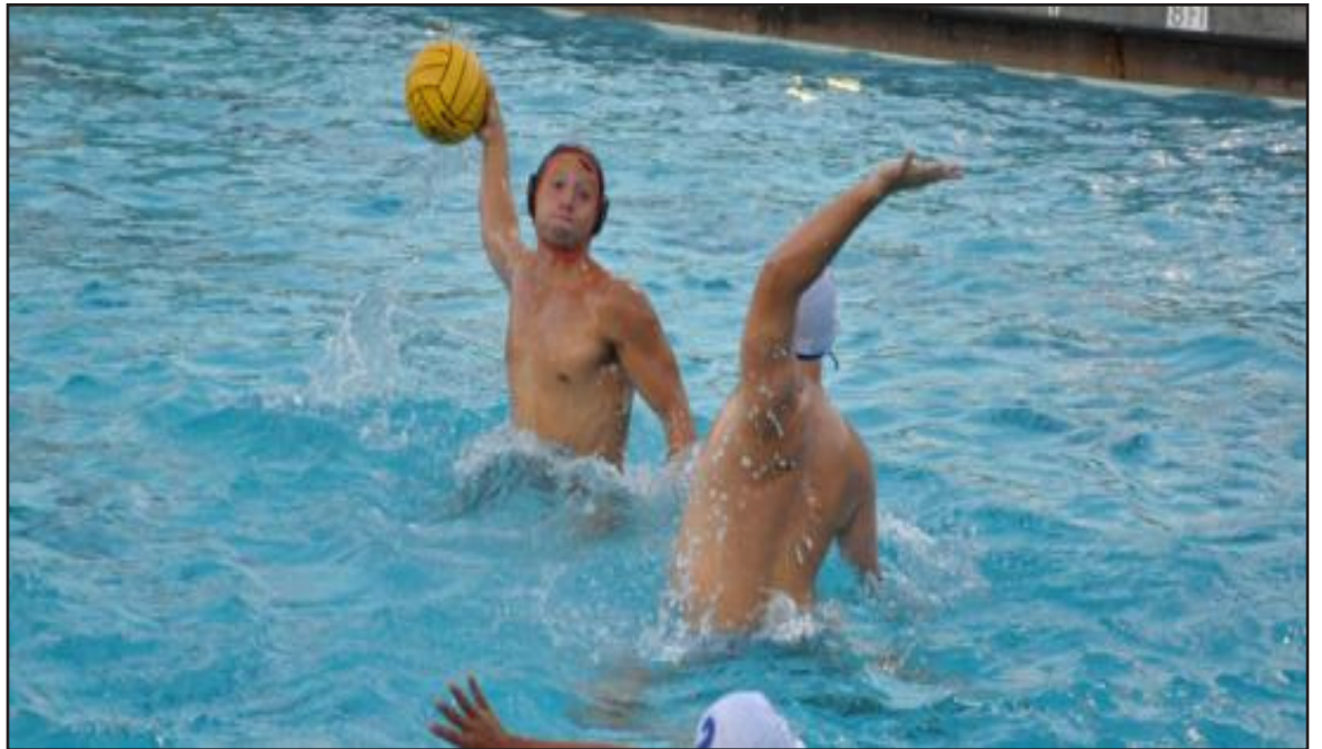
The men's water polo team defeated Citrus College on Wednesday, 15-12. What kind of a name is Citrus College? I vote Caltech be renamed the Banana Institute of Technology.