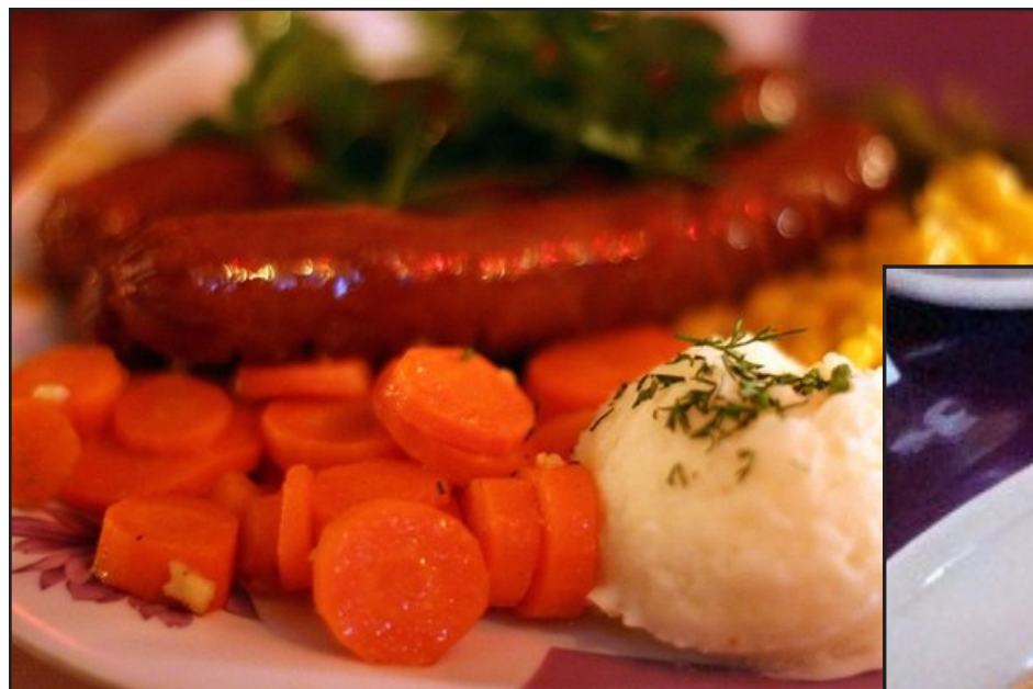
Above: The kielbasa at Polka is paired with a generous portion of veggies and starches, including potato, carrots, corn, and assorted greens.

Bigos (Polish Hunter Stew) – A huge portion of food! The stew has a bit of everything including sauerkraut, mushrooms, sausage and beef. It would be great on a cold, rainy day.