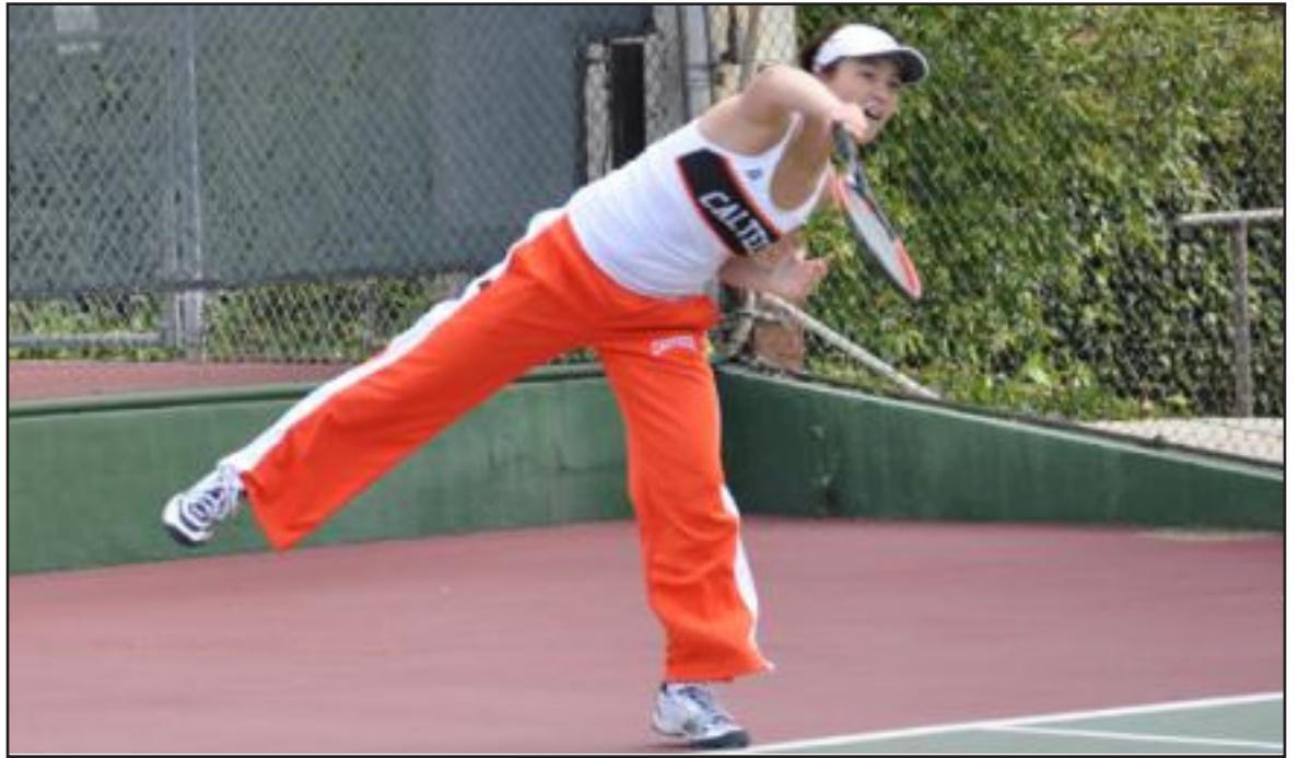
It's the new tennis dance move. Yeah, tennis!

Tennis Match Results La Verne vs Caltech Apr 14, 2012 at Pasadena, CA (Braun Tennis Courts)