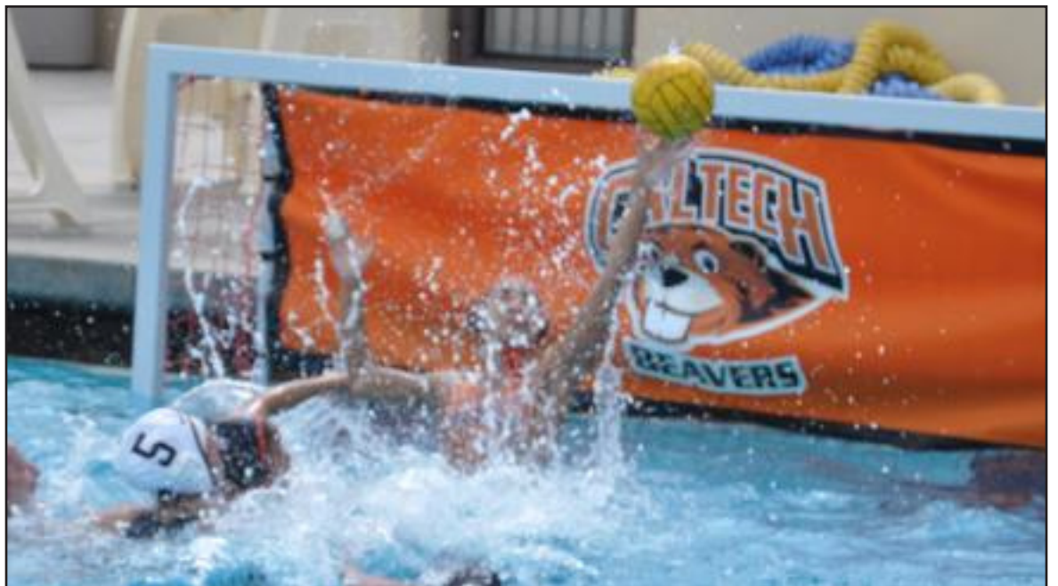
I have no idea what's happening in this picture. I think some sort of fountain malfunctioned.