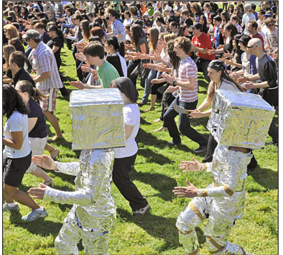
To raise awareness for their cause, Robogals attempts to break the world record for "largest robot dance."