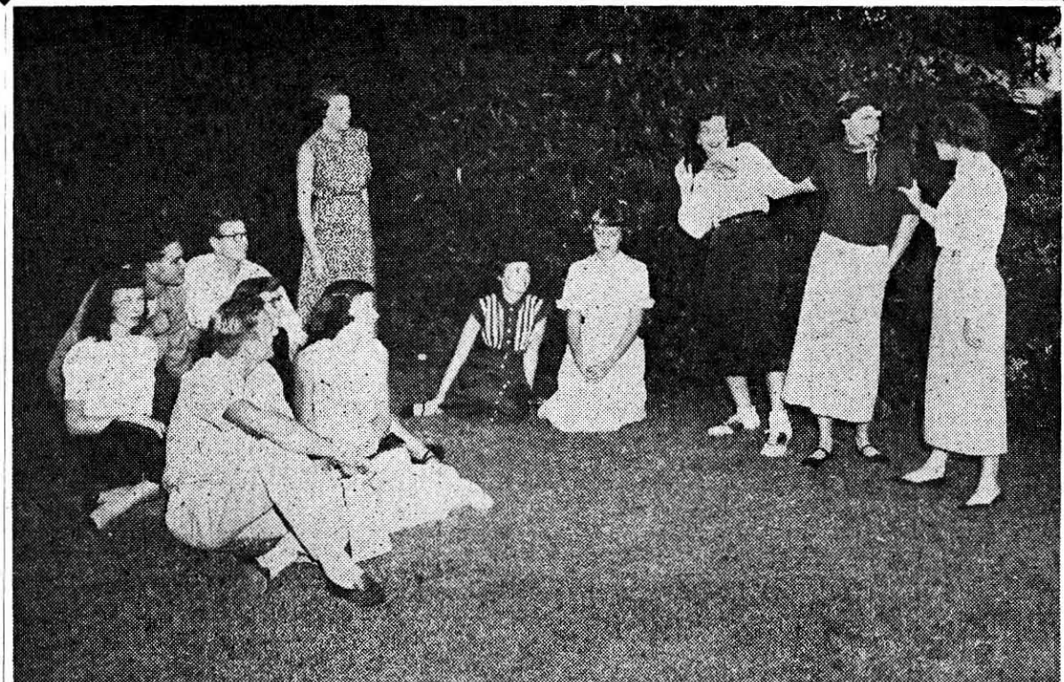
These seven talented young ladies of Occidental College will present "Adam's Rib," a thrilling melodrama, to the Caltech Pajamarino audience at Legion Hall tonight.