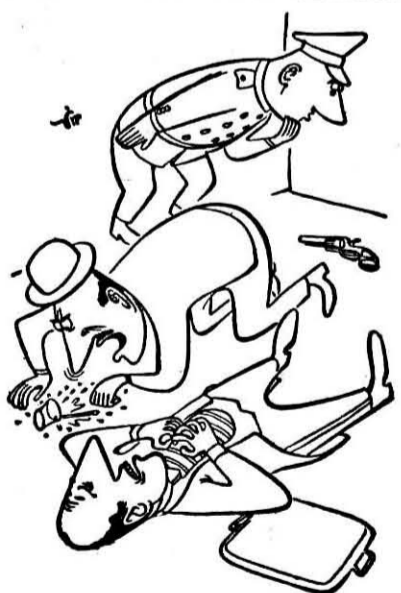
"Obvious! He was murdered for not using enough Angostura* in the Old Fashioneds!"

More People Smoke Camels than any other cigarette!