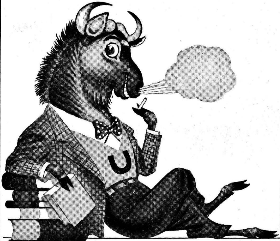
"I gnu the answers...but I wasn't talking!"

The debating team couldn't make much use of this non-talkative baby...but one look at his "literary leanings" tells you that tests don't buffalo him . 'Specially those tricky cigarette tests! As a smoker, you probably know, too, that one puff or one sniff—or a mere one-inhale comparison can't prove very much about a cigarette!