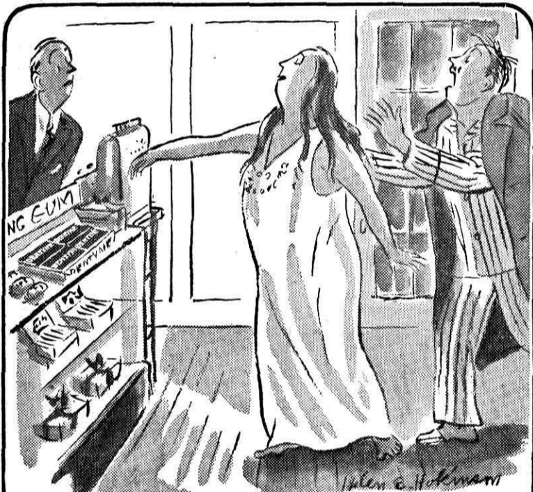
"She'll snap right out of it as soon as she gets her Dentyne Chewing Gum."

CALIFORNIA PHARMACY PRESCRIPTIONS PHARMACISTS 575 S. Lake Street Pasadena, Cal. SYcamore 2-6222