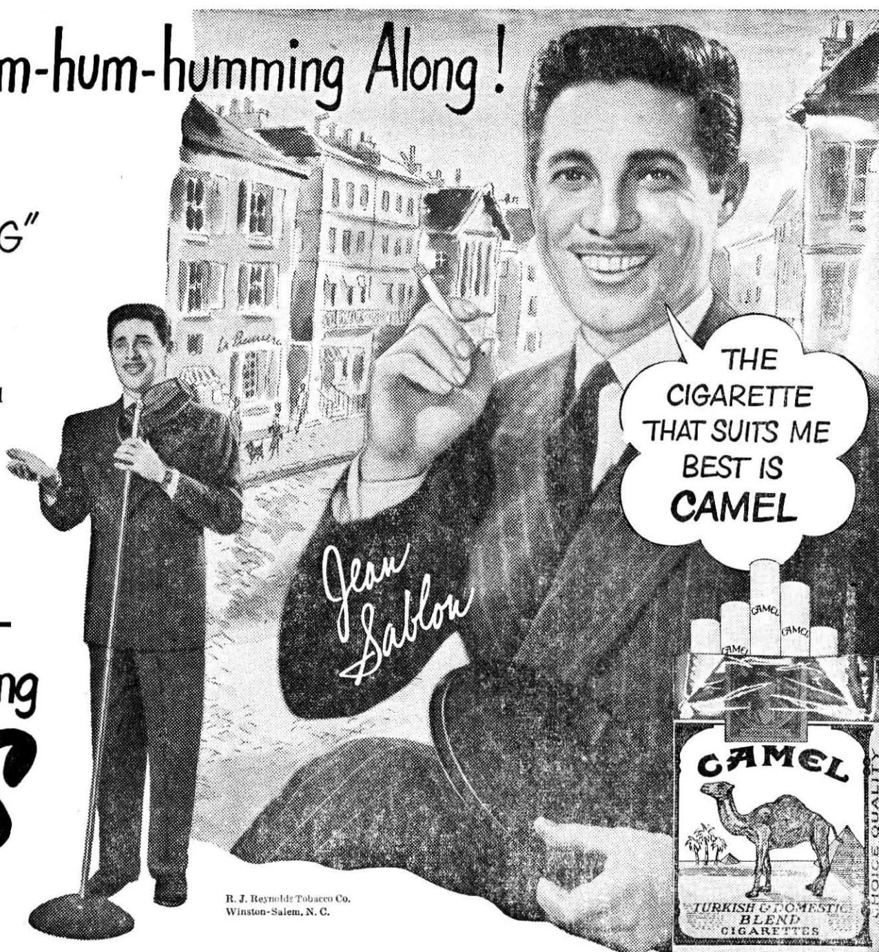
R. J. Reynolds Tobacco Co. Winston-Salem, N. C.