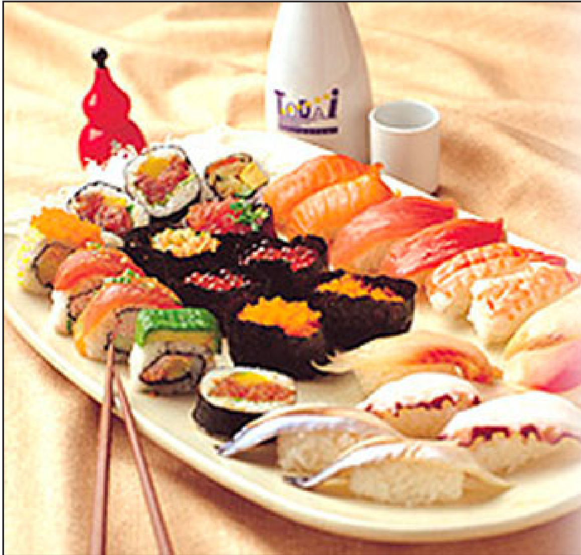
Todai offers a dizzying array of sushi options, so make sure to come with an empty stomach. - www.pasadenaweekly.com

I grabbed a plate and set off to explore the sushi section. There must have been at least 25 different types of sushi to choose from, including generously cut portions of sashimi, traditional rolls, crazy rolls with zesty sauces, and custom made