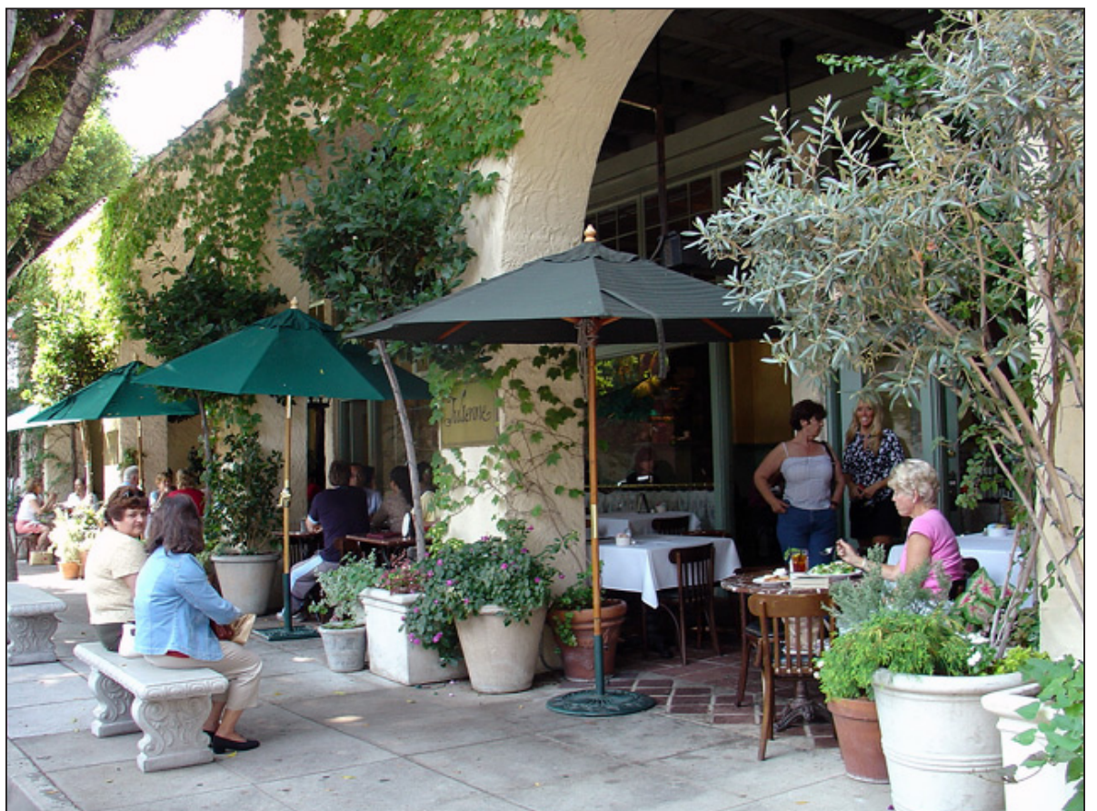
Julienne is situated in scenic San Marino, making it the perfect spot for a Techer to just sit back and relax.

Quality: Go there! Get the Crème Brulee French toast. Seriously.