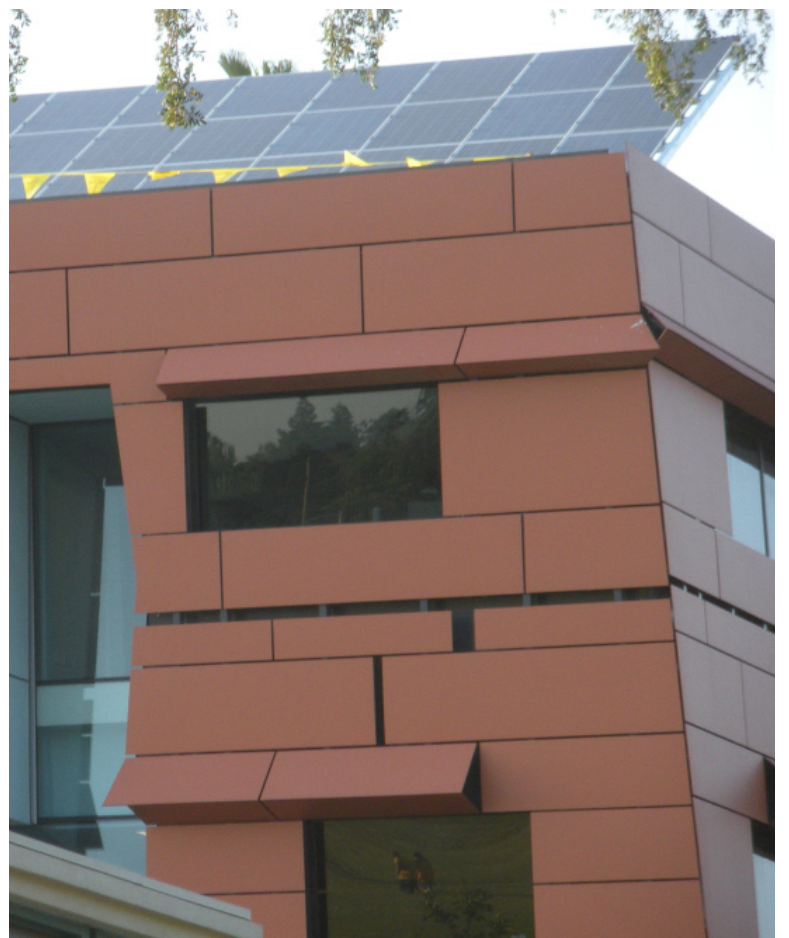
Cahill shows off recent solar panels

The Caltech solar initiative consists of two consecutive phases, primarily financed by the Caltech Energy Conservation Investment Program in coordination with Perpetual Energy Systems and Suntech. Phase I, which is made up of the Holliston solar array, was completed in November 2008. Phase II, which includes solar arrays on the Wilson parking structures, Braun Gym, Baxter Hall, IPAC Laboratory, Cahill Center, and Annenberg Center,