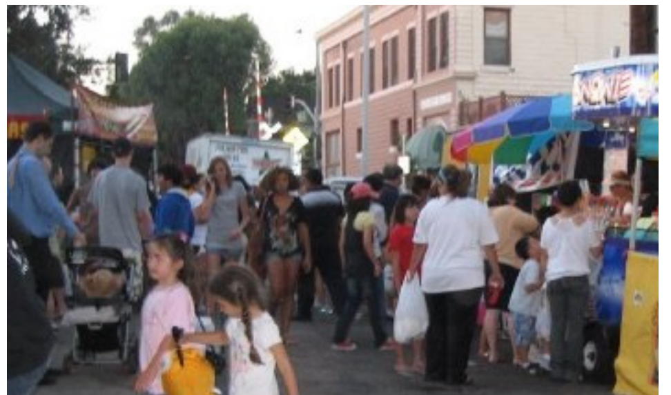
The South Pasadena Farmers Market on Thursdays are bustling with people of all ages