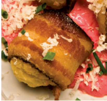
Above: Improbable bacon-wrapped matzoh balls over pink horse-radish sauce.

Most of the dishes on Hall's very short menu sounded a little strange to me and