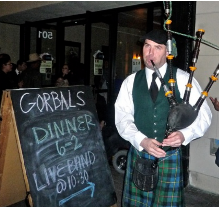
Above: Sign and bagpiper outside of Gorbals directing diners to the restaurant.