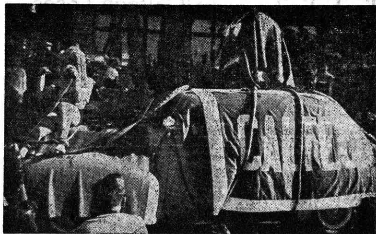
The long arms of Tech reach out to strangle Oxy in the Tournament of Seaweed parade at Asilomar.