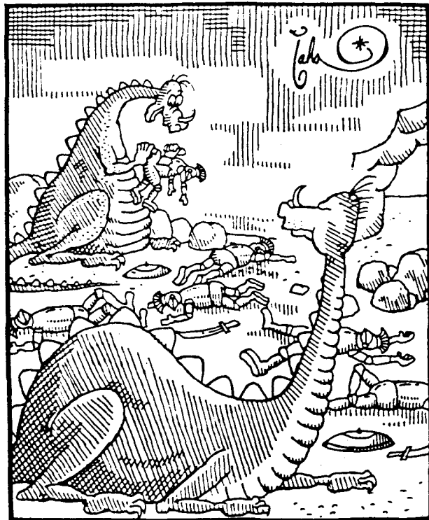
Hey! There's meat inside these things.