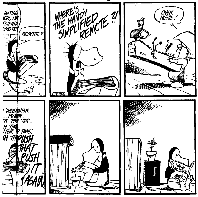
BLOOM COUNTY by Berke Breathed