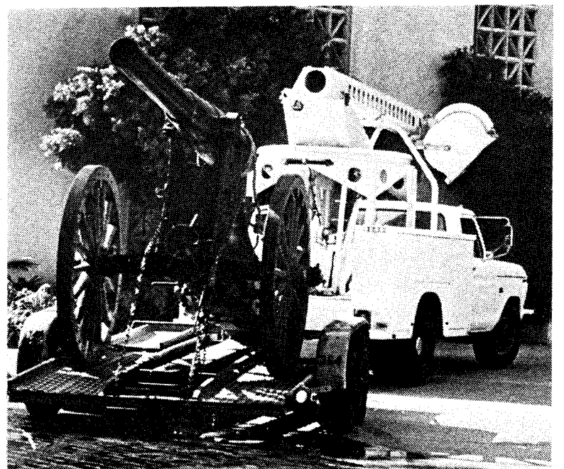
AND AN OLD ONE DEPARTS. The Fleming cannon left campus after a two year visit. Notice the extensive B&G assistance in RETURNING this fine art object.